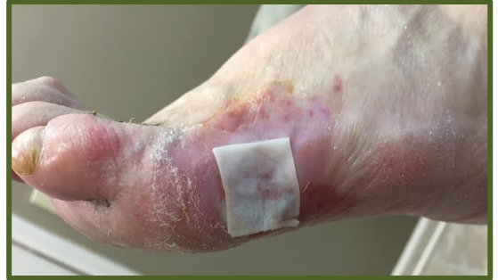
Day 0 – Procedure Day

6 weeks: With minimal standard of care follow-up, the wound healed completely with healthy epithelialization.