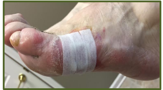
6 weeks – Full closure