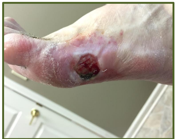
Initial Wound Presentation

PE includes: General physical exam was negative. Vascular exam demonstrated palpable pedal pulses and immediate capillary refill time. Initially, the left foot had a plantar ulceration to the 1 st Metatarsal head. During the post-operative period for the initial wound, he developed a lateral 5 th metatarsal head ulceration with necrotic tissue. Wound measured 2.7cm x 2cm x 0.3cm.